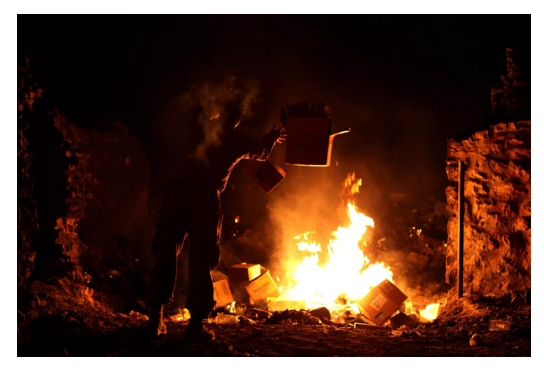
A U.S. Marine at forward operating base Zeebrudge in Helmand province, Afghanistan, burns trash in March 2013