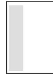
1/3 Page V (2.16"x9.16")