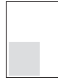
1/3 Page SQ (4.5"x4.5")