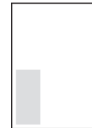
1/6 Page (2.16"x4.5")