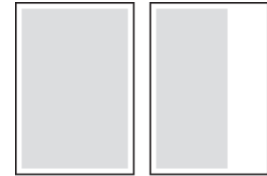
Full Page (6.83"x9.16")