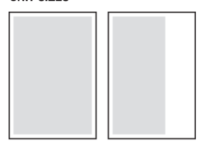
F4.15 Regge 66.83"x9.16") 2/3 Page