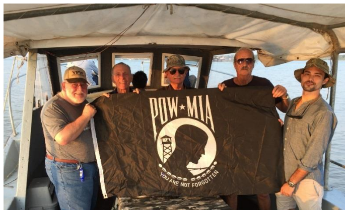
On the Mekong River aboard a former Vietnam War riverine boat with members of VFW Post 11575, Phnom Penh, Cambodia.

The 49 Americans currently listed as MIA are the toughest of the tough to resolve because the Khmer Rouge's four-year destruction of libraries, and subsequent genocide of an estimated 1.7 million fellow Cambodians, left few records or witnesses. The ongoing recovery operation is an aircraft crash that left a 1,500-square-meter debris field, yet DPAA is hopeful because the site is undisturbed, as local villagers did not scavenge metal after the crash. There is another hopeful site, but a border dispute with neighboring Laos has to be resolved before U.S. teams are able to return to the location.