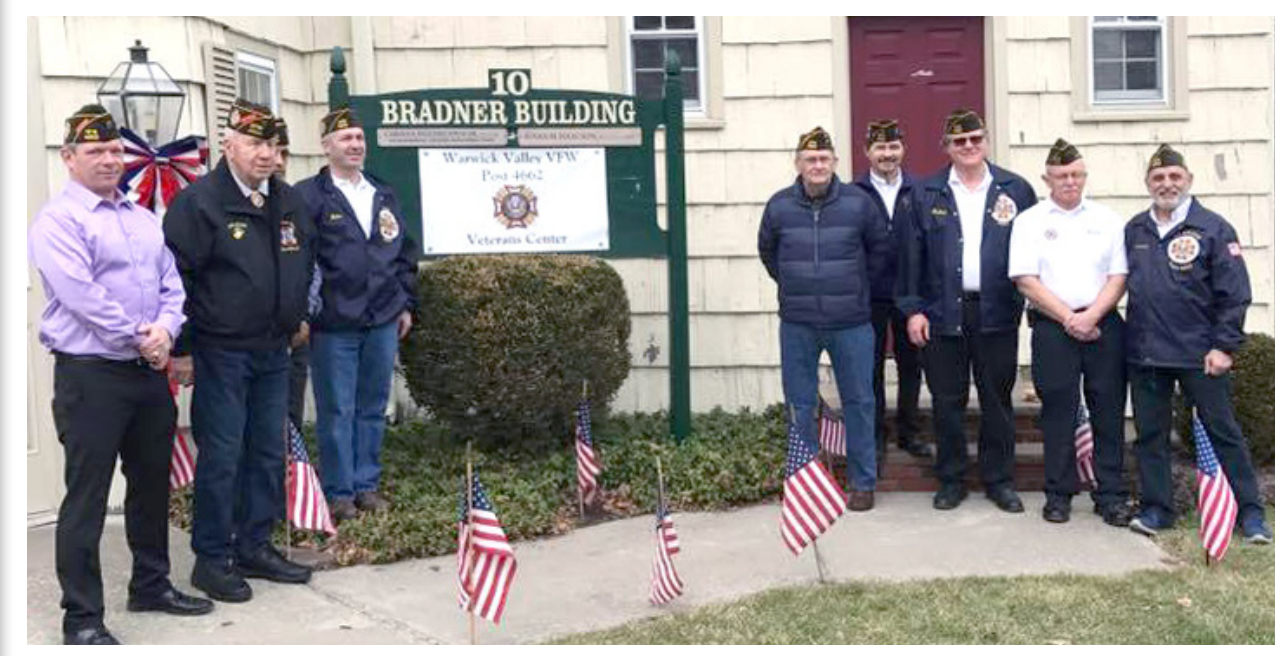
After a ribbon cutting ceremony on March 1 for Warwick's (N.Y.) new Veterans Information Center, VFW Post 4662 members show off the location where veterans can receive counseling and assistance on applying for benefits, as well as attend classes and seminars. The center also offers art and yoga classes.

Thanks to the work of VFW Post 4662 in Warwick, N.Y., their community's veterans will have a place to visit where they can receive assistance with applying for VA benefits, attend seminars and take yoga classes.